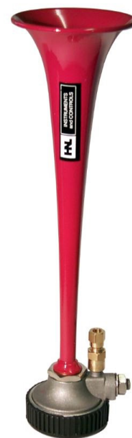
842 - Series