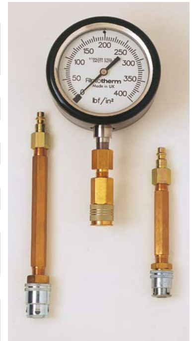
SafeGauge Aircraft Tyre Pressure Gauge - with rigid stem fixing

For other options, please contact us Sales@rototherm.co.uk or +44 (0)1656 740551