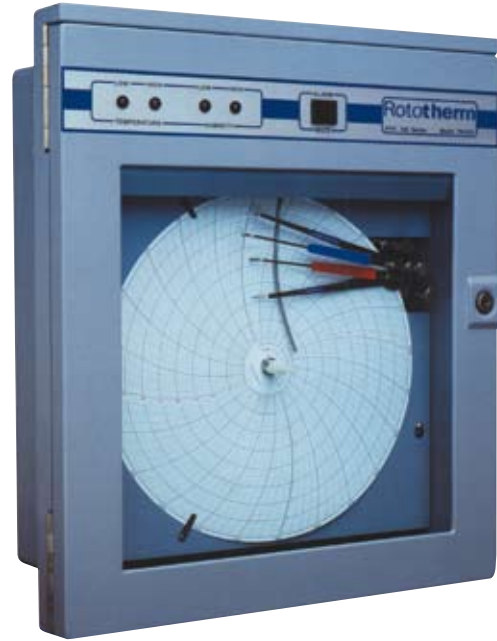
Photograph shows control option that is no longer available

Temperature instruments: 0 to 90%RH Temperature/humidity inst.: 20 to 85% RH